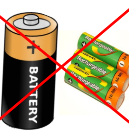
Batteries of any kind